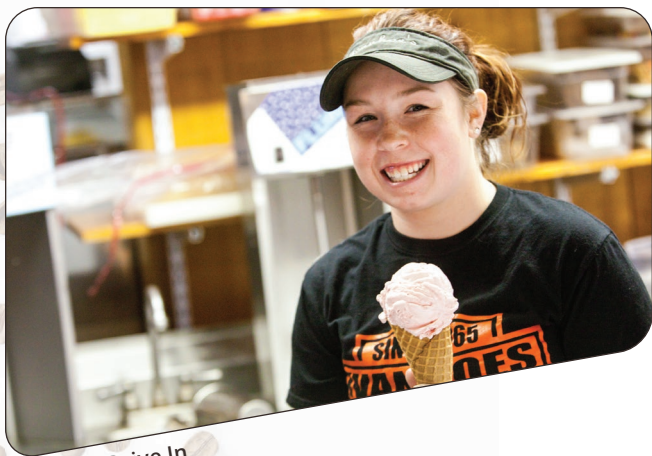
Ivanhoes Drive In