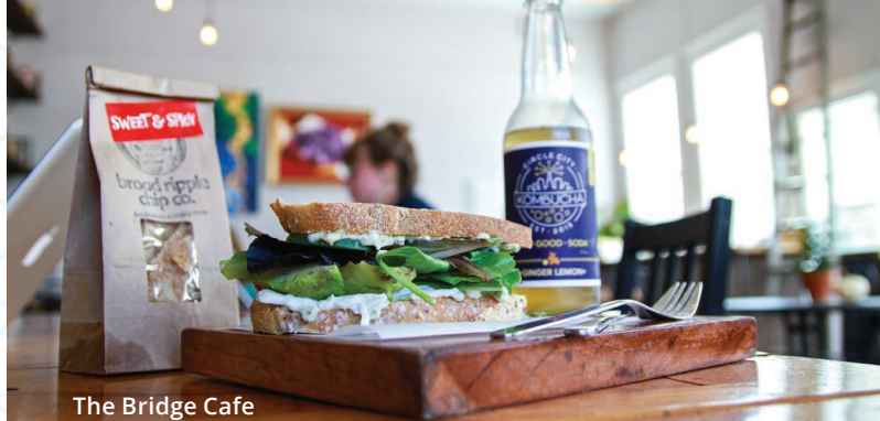
The Bridge Cafe