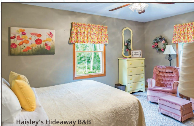
Haisley's Hideaway B&B