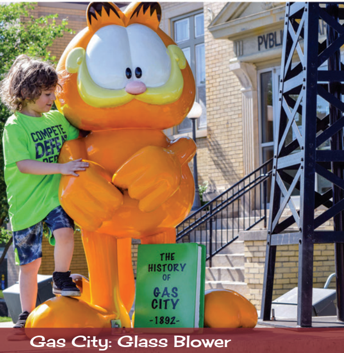
Gas City: Glass Blower

Dial 765-997-7034 and follow the prompts.